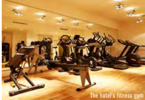
The hotel's fitness gym