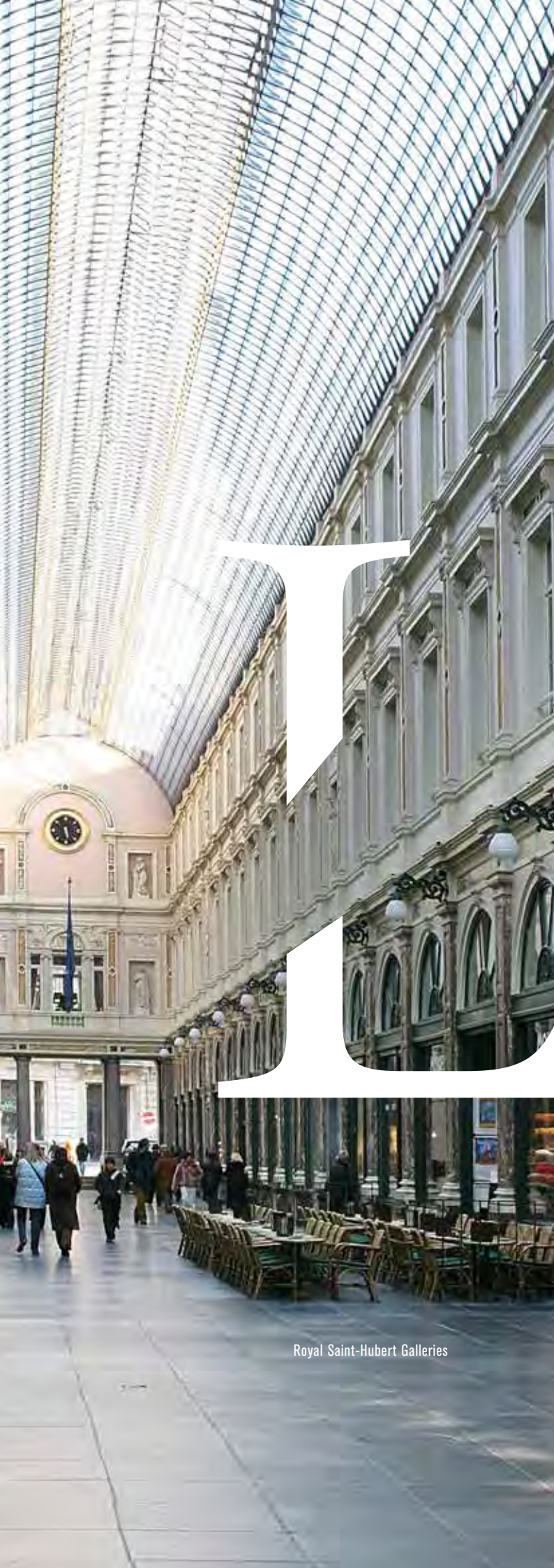
Royal Saint-Hubert Galleries